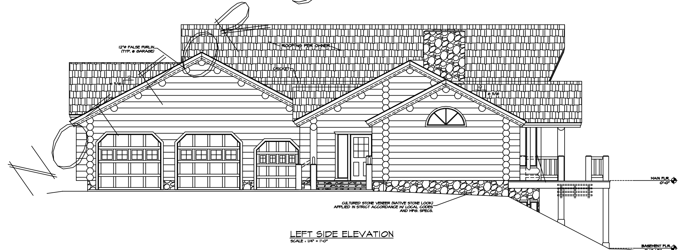
LEFT SIDE ELEVATION SCALE: 1/4" = 1'-0"

CULTURED STONE VENEER (NATIVE STONE LOOK) APPLIED IN STRICT ACCORDANCE W/ LOCAL CODES AND MFG. SPECS.