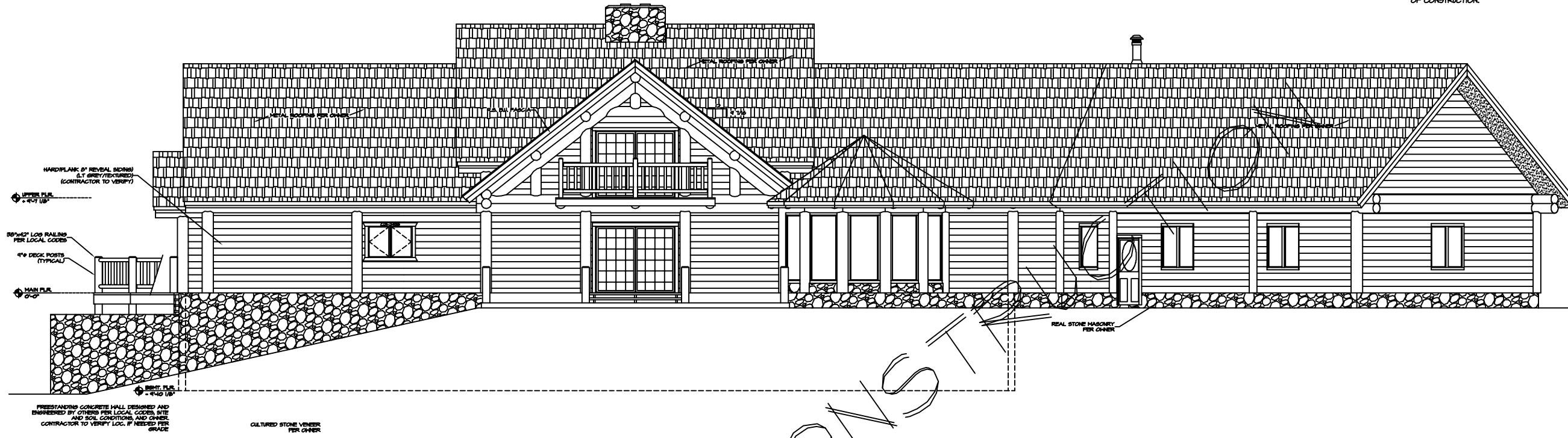
REAR ELEVATION SCALE: 3/8" = 1'-0"

REFER ANY QUESTIONS OR DISCREPANCIES TO QDD BEFORE START OF CONSTRUCTION.