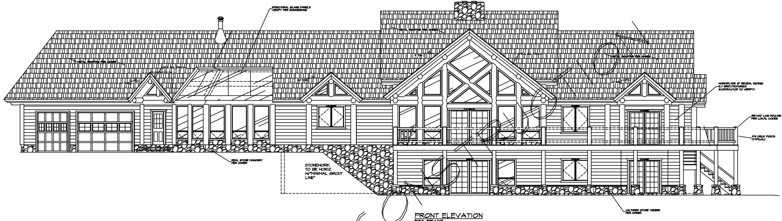
FRONT ELEVATION SCALE: 3/8" = 1'-0"

REFER ANY QUESTIONS OR DISCREPANCIES TO QDD BEFORE START OF CONSTRUCTION.