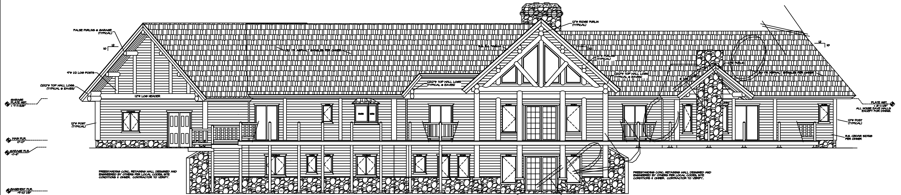
REAR ELEVATION SCALE: 3/16" = 1'-0"

COPYRIGHTED BY QUICKDRAW DRAFTING. THIS DRAWING IS NOT TO BE USED FOR MAKING ANY REPRODUCTION THEREOF, OR FOR CONTRACTING ANY BUILDING PROJECT WITHOUT OBTAINING THE WRITTEN PERMISSION OF THE COPYRIGHT HOLDER, QUICKDRAW DRAFTING. DO NOT SCALE DRAWINGS. QUICKDRAW DRAFTING IS NOT RESPONSIBLE FOR ERRORS DUE TO SCALED DRAWINGS. REFER ANY QUESTIONS OR DISCREPANCIES TO QUICKDRAW DRAFTING BEFORE START OF CONSTRUCTION.