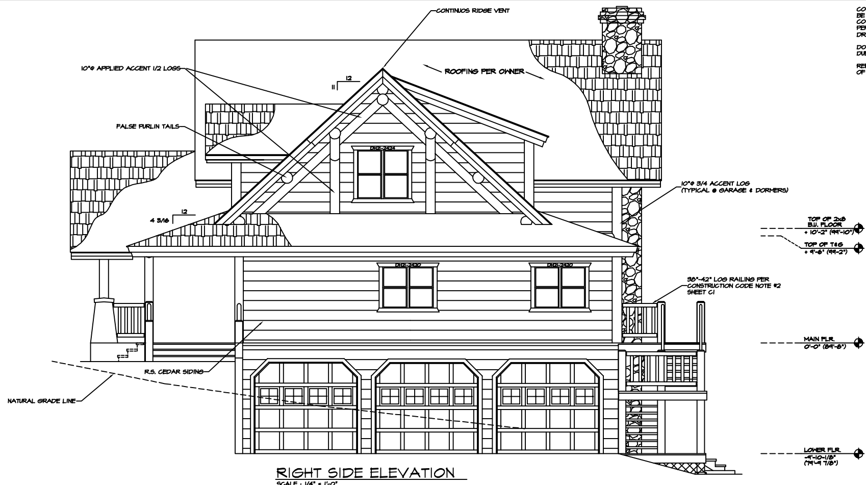
RIGHT SIDE ELEVATION SCALE: 1/4" = 1'-0"

COPYRIGHTED BY QUICKDRAW DRAFTING. THIS DRAWING IS NOT TO BE USED FOR MAKING ANY REPRODUCTION THEREOF OR FOR CONTRACTING ANY BUILDING WITHOUT FIRST OBTAINING THE WRITTEN PERMISSION OF THE COPYRIGHT HOLDER, QUICKDRAW DESIGN & DRAFTING (GDD). DO NOT SCALE DRAWINGS. GDD IS NOT RESPONSIBLE FOR ERRORS DUE TO SCALED DRAWINGS. REFER ANY QUESTIONS OR DISCREPANCIES TO GDD BEFORE START OF CONSTRUCTION.